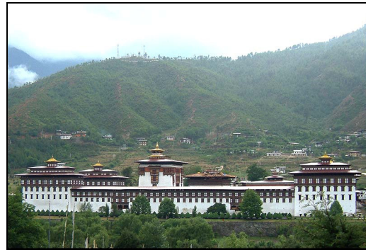
Thimphu, Capital of Bhutan

Morning visit to the memorial Chorten built in the memory of Lt. His Majesty the King by Royal Queen Mother, visit Changkha Lhakhang, Motithang mini Zoo to see the National animal: The Takin.